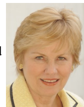
By Audrey Grant

There is a way to improve your bidding, play, and defense through the Online Daily Bridge Column. It's interactive. The highly trained world-class robots are programmed to respond and react to your plays. They will challenge you to make the right moves and execute a sound strategy on every deal.